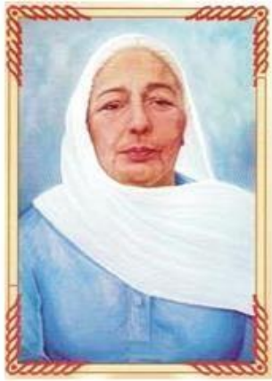
Mata Ram Kaur Ji