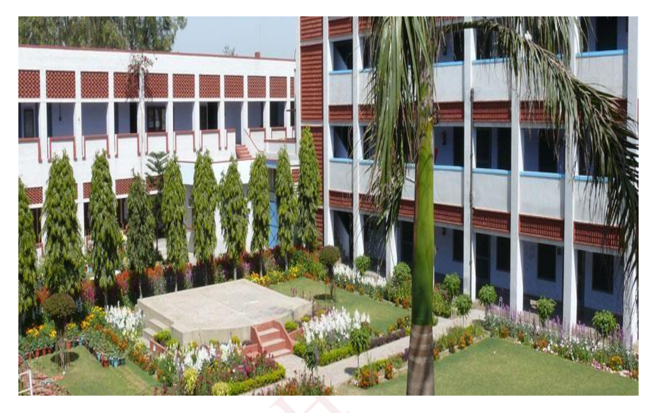
G.H.G. Harparkash College of Education is situated in natural surroundings of village Sidhwan Khurd on Ludhiana -Ferozepur road at a distance of 30 km from Ludhiana. G.H.G. Harparkash College of Education for Women is premier Rural Women Education College.

The Panjab University, Chandigarh approved the recognition of GHG Harparkash College of Education for Women, Sidhwan Khurd, Ludhiana as a centre for pursuing Ph.D Course Work in the subject of Education vide its Notification No. 4002/GHG dated 30.07.2010.