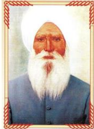
Bhai Sahib Narain Singh Ji